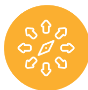
Support and Guidance